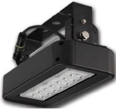
Model Number: AEGTNL24019/ AEGTNL24020